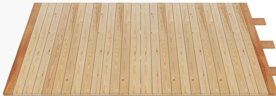
MATERIAL Mixed Hardwood

Three finger locking system joins mats seamlessly